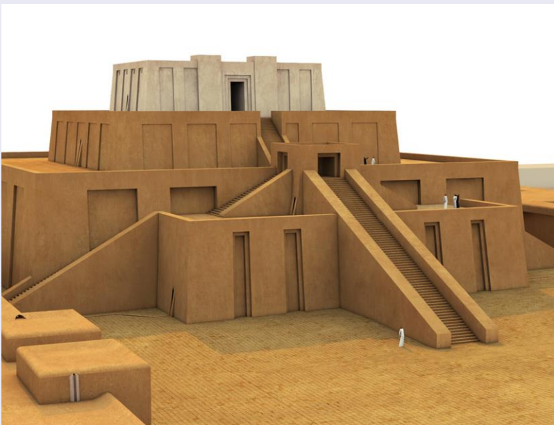
Digital reconstruction of the ziggurat for the goddess Ishtar, Ur III