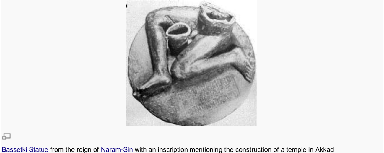
Bassetki Statue from the reign of Naram-Sin with an inscription mentioning the construction of a temple in Akkad

One tablet from this period reads, " (From the earliest days) no-one had made a statue of lead, (but) Rimush king of Kish, had a statue of himself made of lead. It stood before Enlil; and it recited his (Rimush's) virtues to the idu of the gods ". The Bassetki Statue , cast with the lost wax method, testifies to the high level of skill of that craftsmen achieved during the Akkadian period. [61]